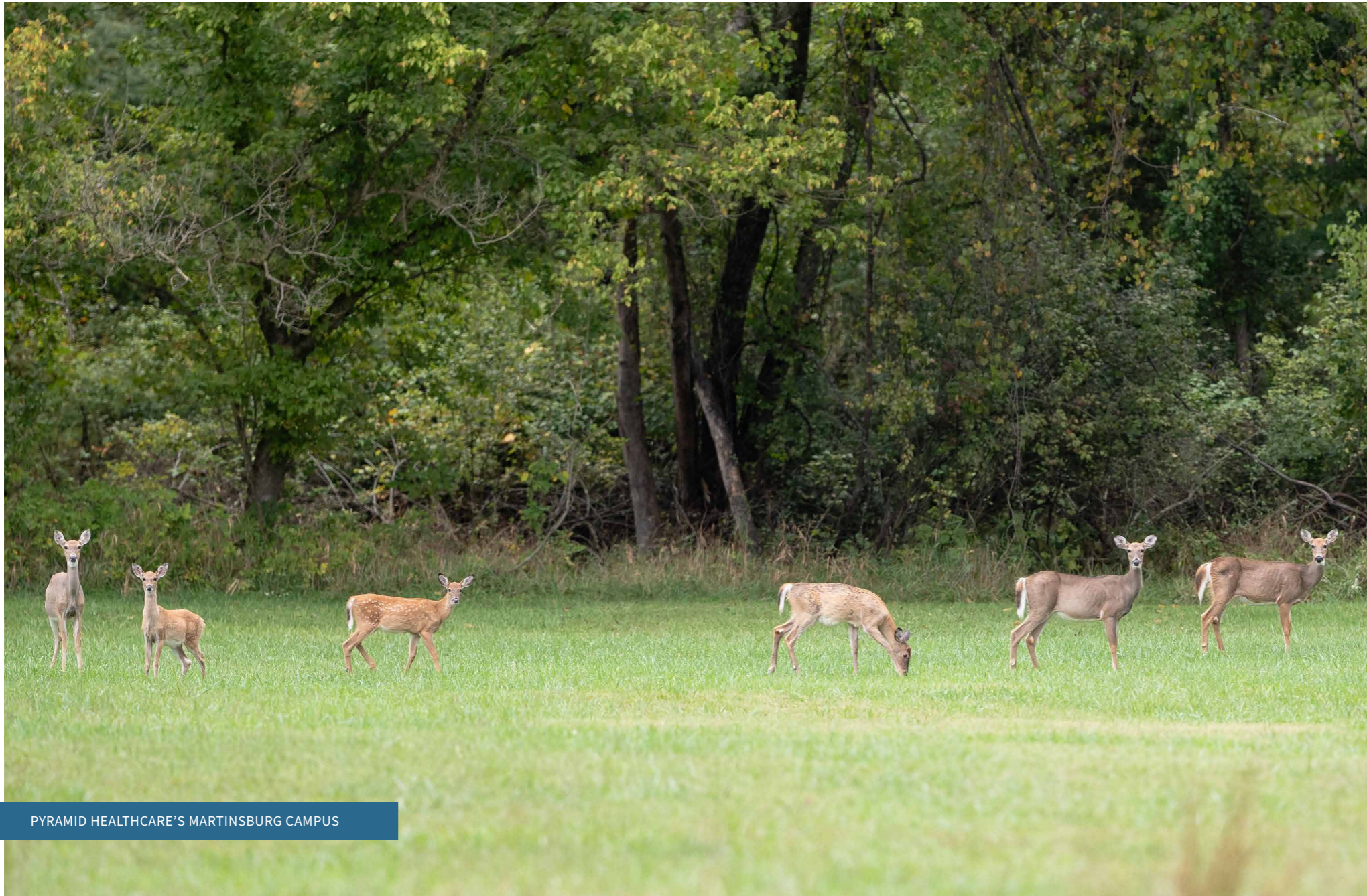
PYRAMID HEALTHCARE'S MARTINSBURG CAMPUS